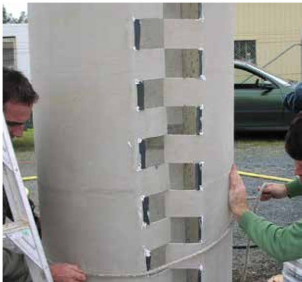
Fig. 2: The 2003 prototype FRP jacket used finger joints bent inward to be embedded in the grout, subsequently placed in the annulus formed between the pile and the jacket

The former challenge precluded the use of individual RC encasements, and the latter challenge created obvious safety concerns. Both increased the complexity and cost of the traditional approach, so the DTMR investigated additional approaches that would better fit its limited budget.