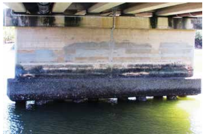
Fig. 1: View of a typical blade pier rising from a pile cap supported on 10 closely spaced PC piles