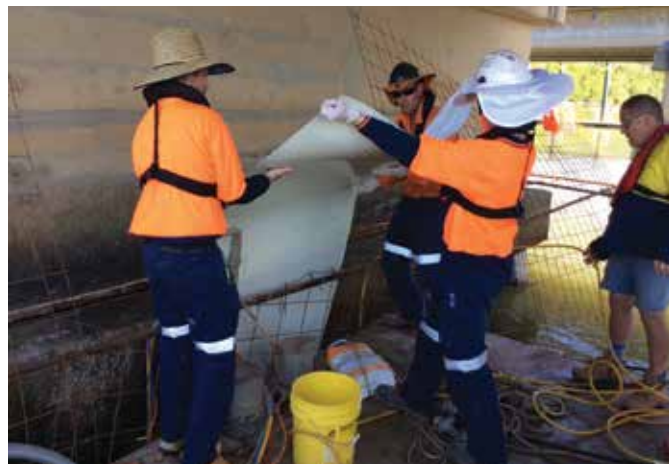
Fig. 4: Coated laminate being passed to the diving crew for installation

such as those published by ACI Committee 440 8 provide detailed information for such factors.