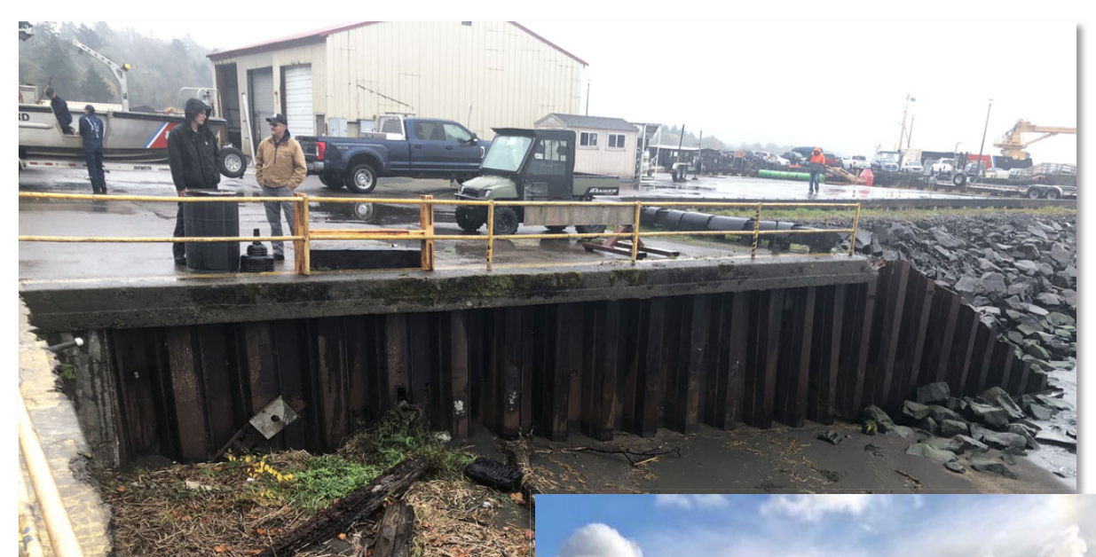
U.S. Coast Guard facility at Tongue Point, Astoria, OR, before and during repair of steel sheet pile bulkhead.