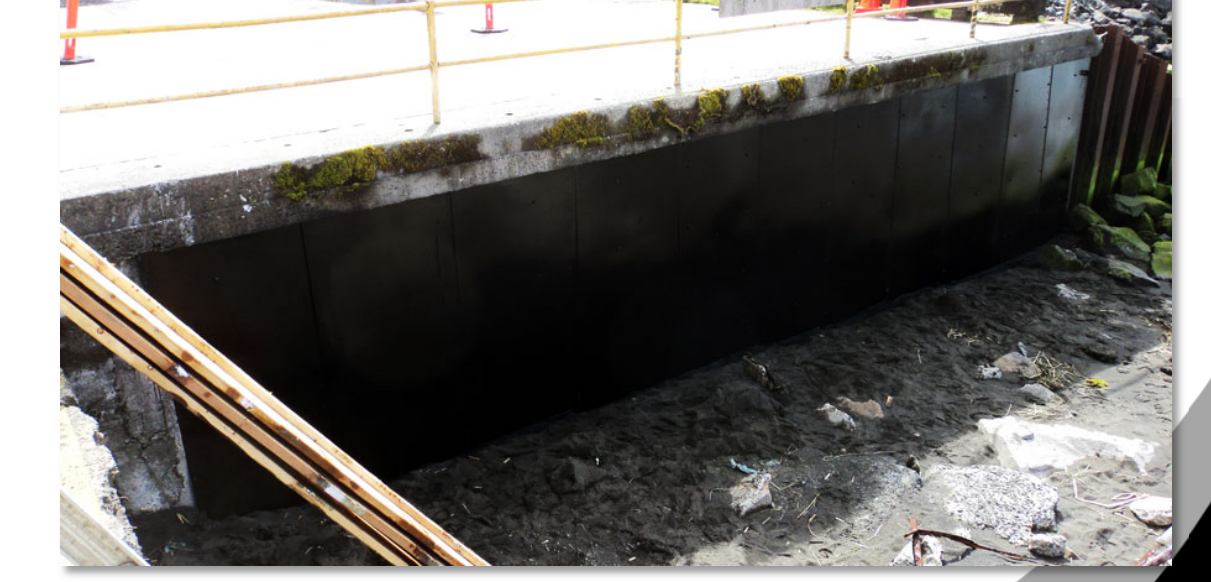
A black epoxy is applied upon completion of repair as requested by customer.

Repairs to steel sheet pile bulkhead using the SPiRe® by QuakeWrap system are at near completion, left, and completion, bottom.