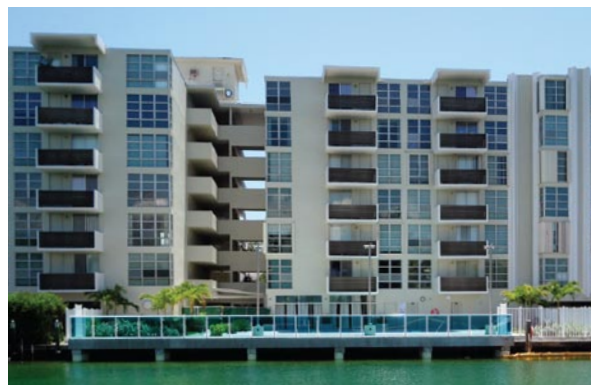
Fig. 4: Guilford House Condominiums, Bay Harbor Islands, FL