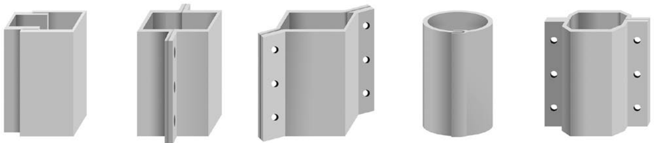
Fig. 1: Typical GFRP jackets used for repair of piles in North America

In a patent-pending process developed by the author, sheets of glass or carbon fabric are impregnated with resin in the manufacturing plant and pressed together under high pressure and heat to produce very thin laminates. PileMedic™ laminates are manufactured in thicknesses