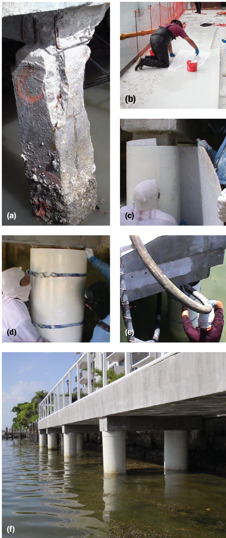
Fig. 5: PileMedic™ repair steps: (a) deteriorated pile; (b) applying moisture-insensitive epoxy to laminate; (c) transporting laminate into water and wrapping it around pile; (d) final jacket size adjustment and temporary support by ratchet straps; (e) filling annular space; and (f) completed piles after removal of ratchet straps

insensitive and it cures underwater, eliminating the need for any coffer dams. The epoxy was mixed using a jiffy mixer and applied with a thickness of 40 mil (0.04 in. [1 mm]) to the 66+8 = 74 in. (1880 mm) length of the laminate; the first 66 in. (1680 mm) length of the laminate that will be placed next to the pile does not need to be coated with epoxy (Fig. 5(b)).