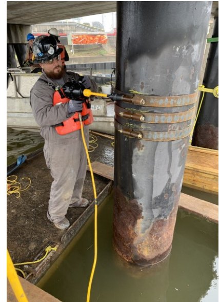
Fig. 4. ShearClamp™ used on H-piles and ShearWrap™ steel bands that are torqued around circular steel piles.