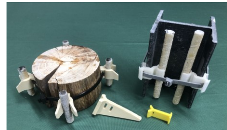
Fig. 3. Sample spacers and skirt pin.