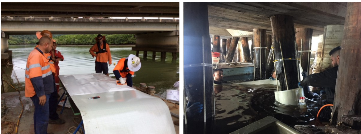
Fig. 1. Laminate being cut to size and coated with epoxy on a barge; divers wrapping the laminate around a pile after the reinforcing bars have been secured in the spacers.