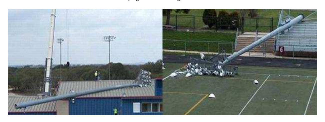
Fallen Stadium Light Poles