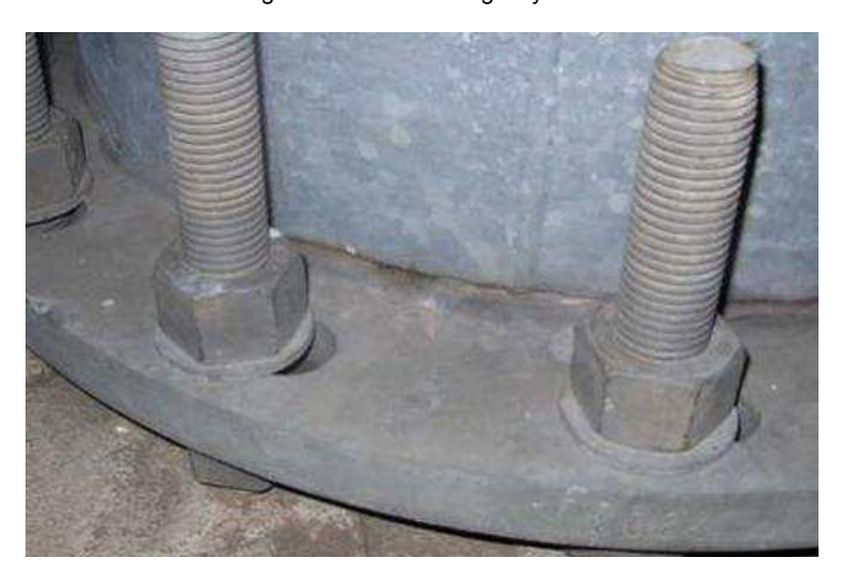
Base Plate of Stadium Light Pole