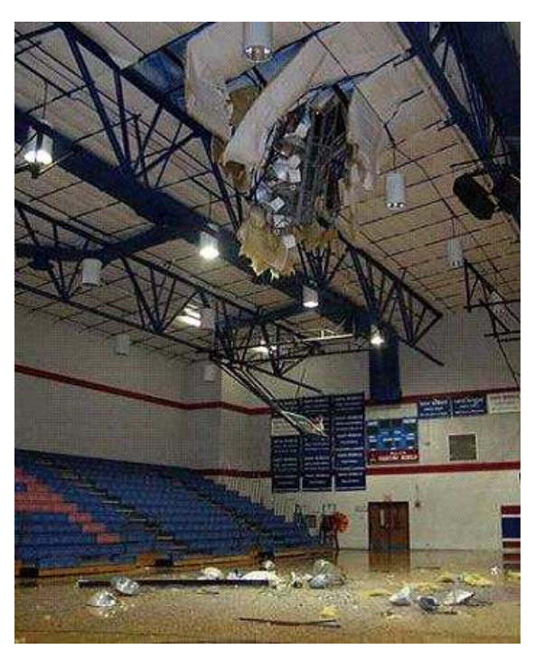
Stadium Light Pole Fallen Through Gymnasium Roof