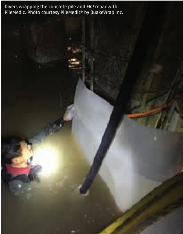
Divers wrapping the concrete pile and FRP rebar with PileMedic.