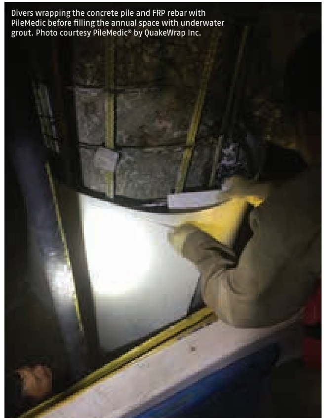
Divers wrapping the concrete pile and FRP rebar with PileMedic before filling the annular space with underwater grout.