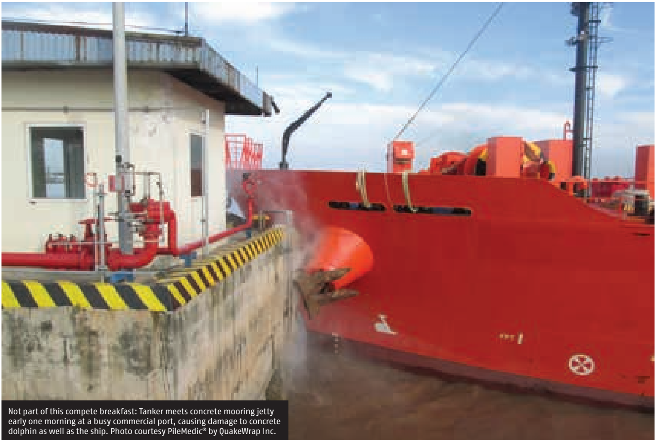
Not part of this complete breakfast: Tanker meets concrete mooring jetty early one morning at a busy commercial port, causing damage to concrete dolphin as well as the ship.