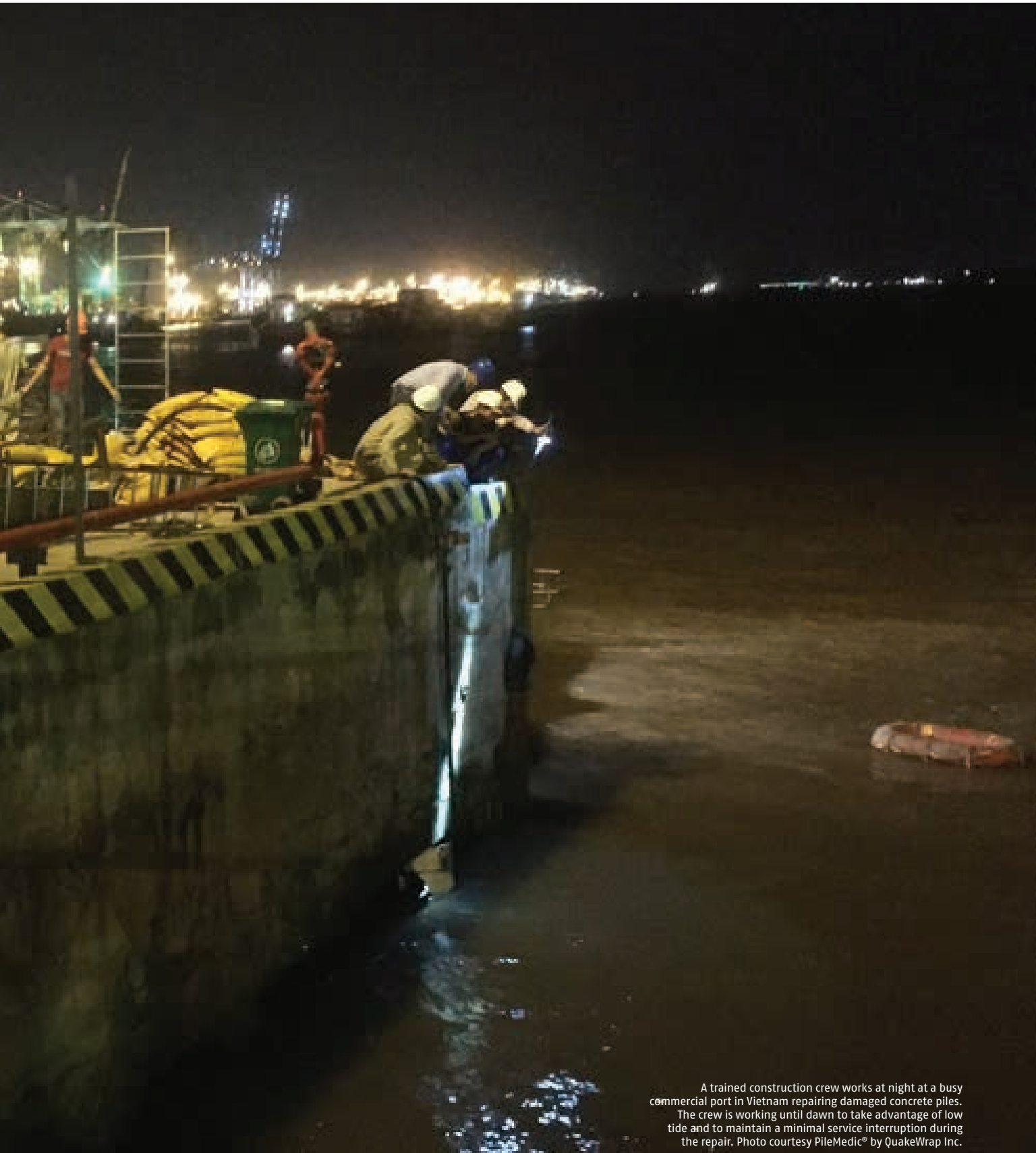
A trained construction crew works at night at a busy commercial port in Vietnam repairing damaged concrete piles. The crew is working until dawn to take advantage of low tide and to maintain a minimal service interruption during the repair.