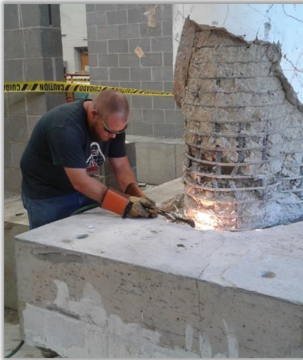
A torch was used to cut the longitudinal steel bars in the foundation.