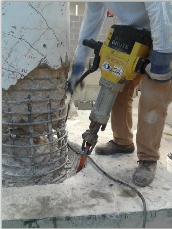
Using a jackhammer, a 10-inch deep narrow trench was cut around the column in the foundation